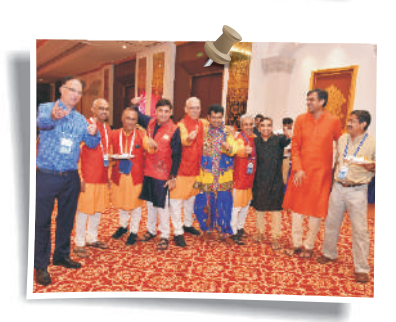
WZ USICON 2019 @ Rajkot